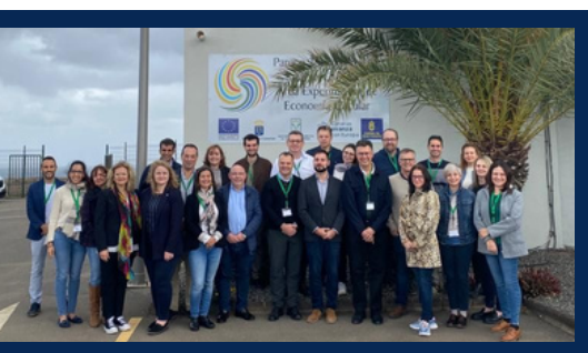
Project Partners reunited at the University of Las Palmas de Gran Canaria

In this regard, the second project meeting was held in January at the University of Las Palmas de Gran Canaria where all partners met to monitor the progress of the project. Issues related to the project’s Work Packages were discussed, the results of the target group surveys were presented, the preparation of training materials on the circular economy in the plastics production sector, and finally, the requirements for the creation of the project’s electronic platform and the presentation of cooperation between businesses and educational institutions were discussed.